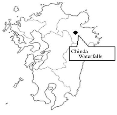
Fig.-1 The Position of the Chinda Waterfall

The planned engineering work required advanced technology for an effective design of reinforcement work against columnar joint rock mass and safety management for the work to be executed right under highly hazardous base mass. Accordingly, an instant falling-rock sensor was developed