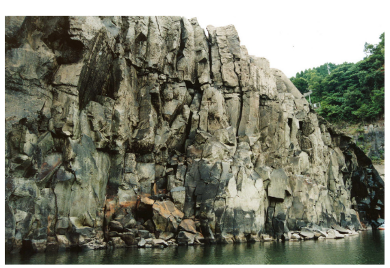
Fig.-3 Welded Tuff on the Surface of Waterfall