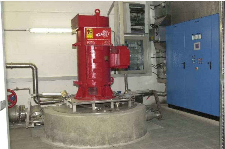
La Louve (CH) – 170 kW – 2006 Separation of run off water from wastewater and transport to the Lake.