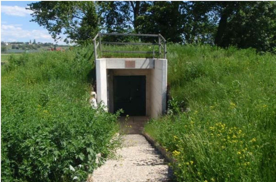
Armory (CH) – 68 kW – 2006 Pressure used for irrigation network during irrigation period