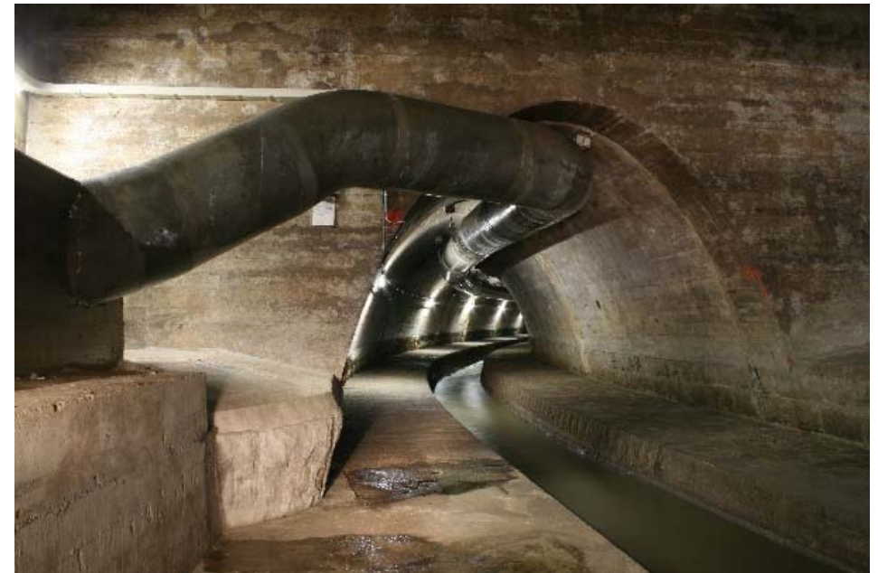
2-nozzle Pelton turbine H_n = 180 \text{ m} , Q = 120 \text{ l/s} 466'000 kWh/year - Production sold to the grid