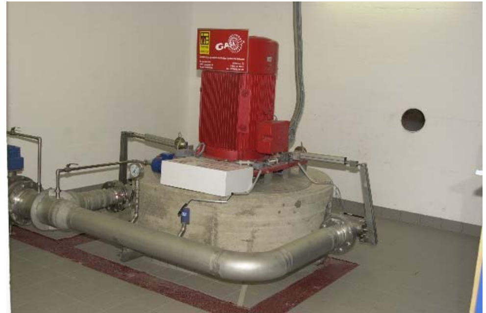
2-nozzle Pelton turbine H_n = 105 \text{ m} , Q = 90 \text{ l/s} 580'000 kWh/year - Production sold to the grid